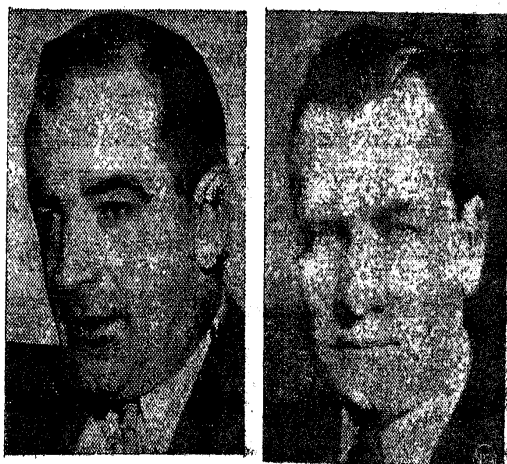
MAIN SPEAKER for northern Nevada Republicans' Lincoln day dinner tonight is Sen. Joseph R. McCarthy of Wisconsin, above left. He will be introduced by Sen. George W. Malone of Nevada, right. The two senators arrived in Reno this morning.